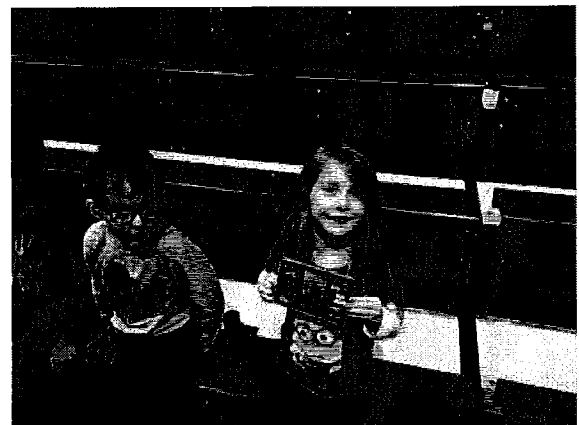
Kindergarten celebrating Veteran's Day