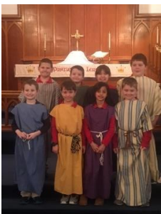
THIRD GRADE LED CHAPEL