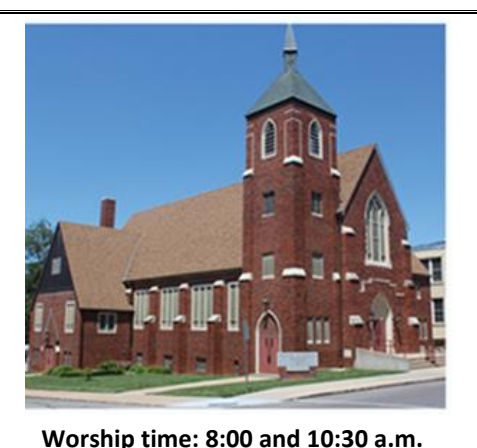
and 6:30 p.m. Sunday School & Bible Classes: 9:15 a.m.