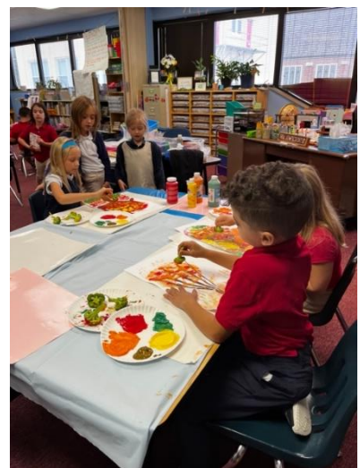
Painting fall trees.