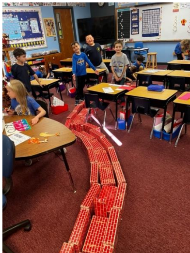
The Great Wall of China from Around the World Night.