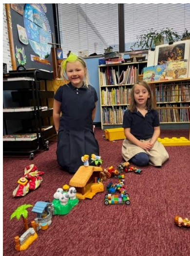
Playing with a Nativity set during Fun Friday.